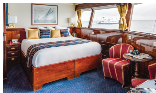
Top: Category 2 cabin. Bottom: Category 5 cabin.

CATEGORY 1: Main Deck # 201-206—Cabins feature a window and two lower single beds which can convert to a queen bed.